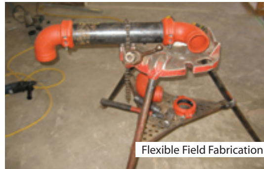
Flexible Field Fabrication