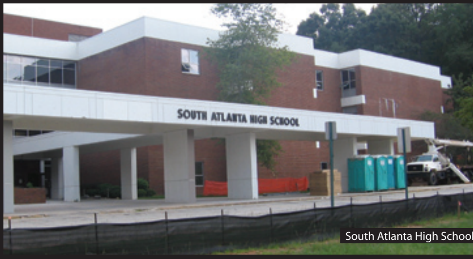
South Atlanta High School

SPECIFICATIONS: 2-10" 705/772 Couplings Strainers Suction Diffusers Circuit Balancing Valves