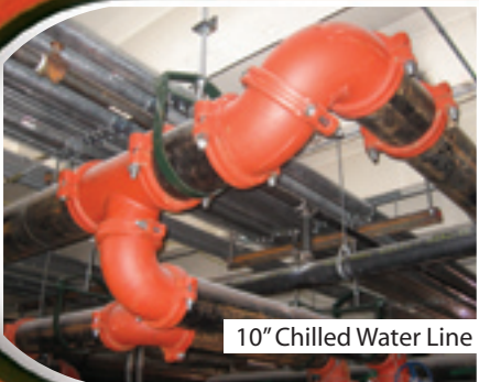
10" Chilled Water Line

South Atlanta High School | Atlanta, Georgia