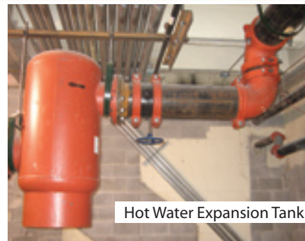
Hot Water Expansion Tank