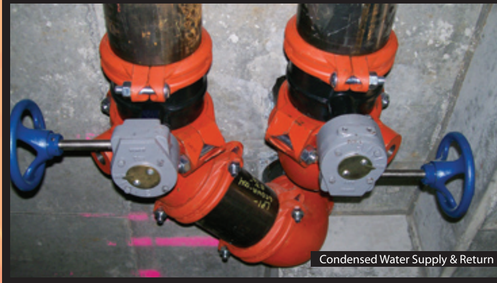
Condensed Water Supply & Return