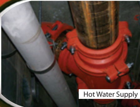
Hot Water Supply