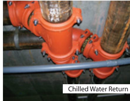
Chilled Water Return