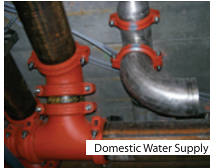
Domestic Water Supply